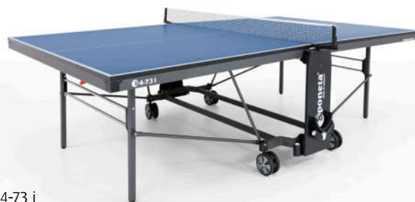
S 4-73 i