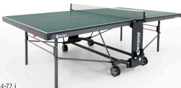
S 4-72 i