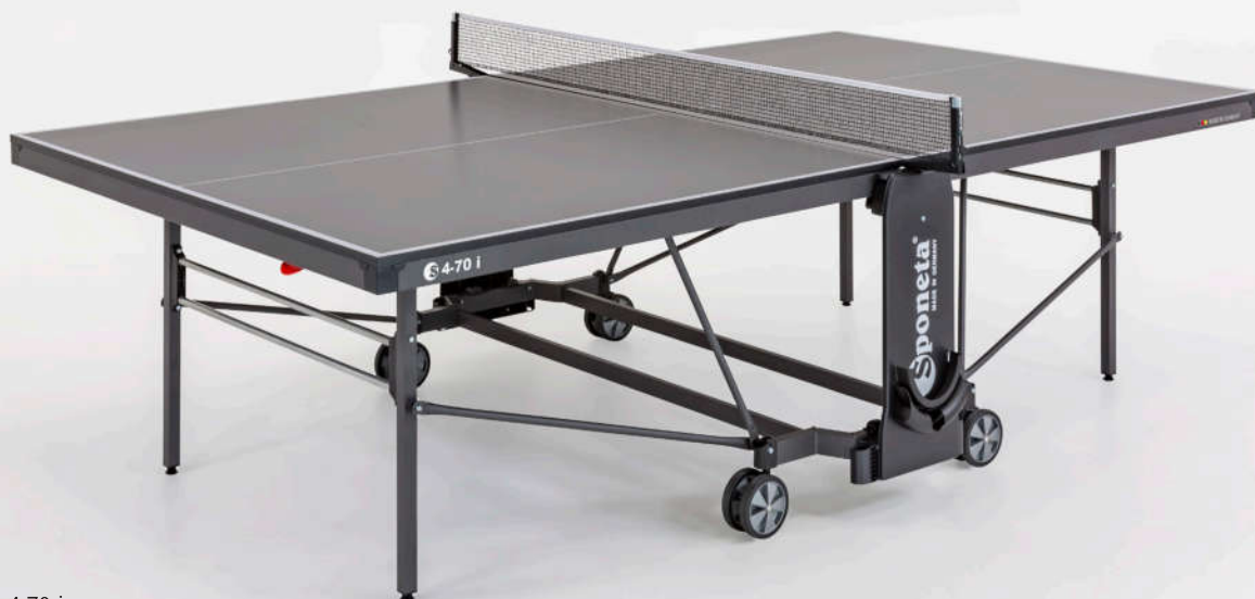
S 4-70 i