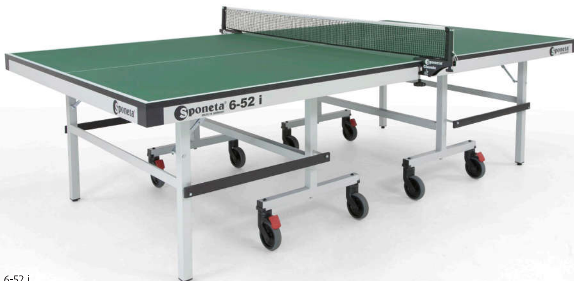
S 6-52 i

Quick-cross bars only 15min of assembly time