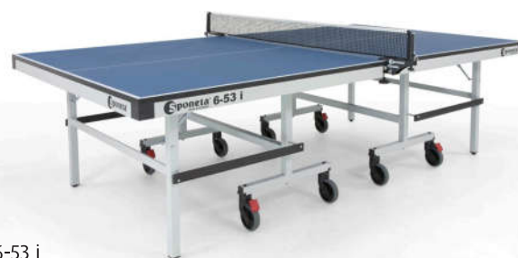
S 6-53 i

Quick-cross bars only 15min of assembly time