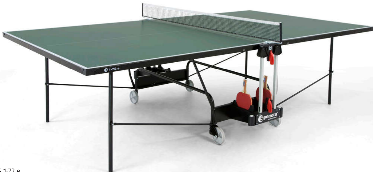
S 1-72 e