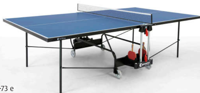
S 1-73 e

1) for outdoor melamine resin boards according to our warranty terms