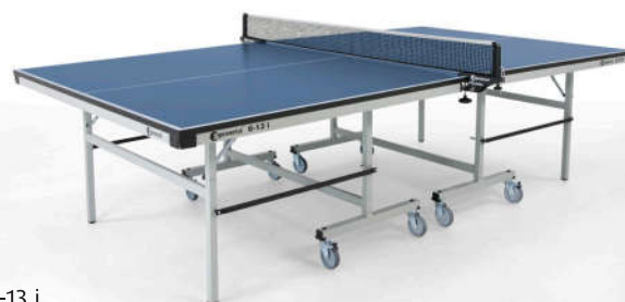
S 6-13 i