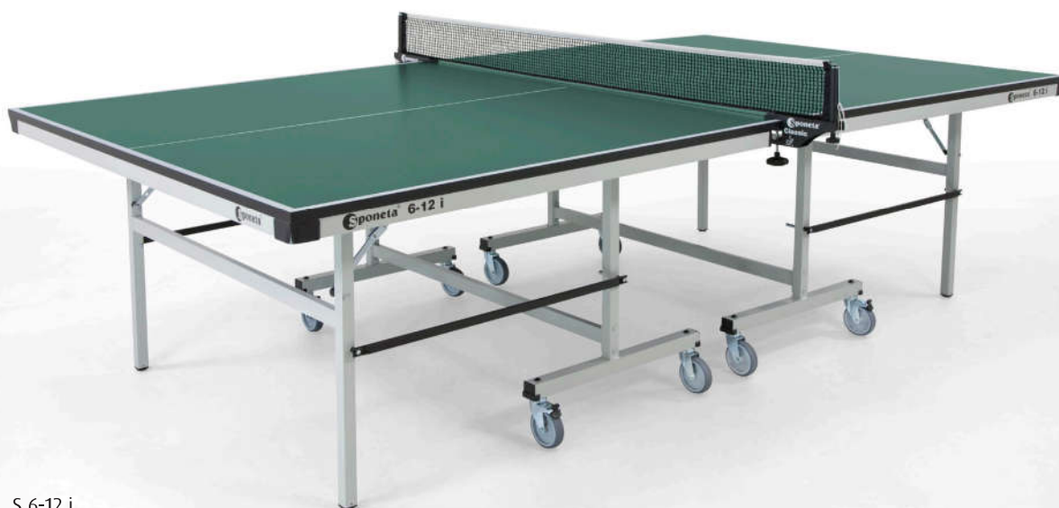
S 6-12 i