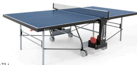
S 3-73 i