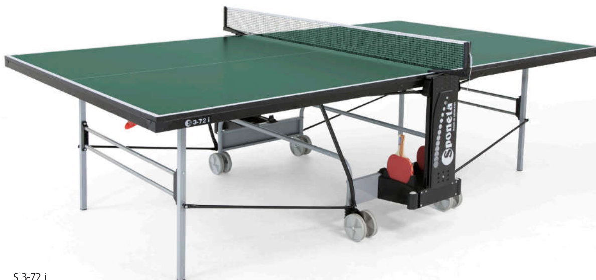
S 3-72 i